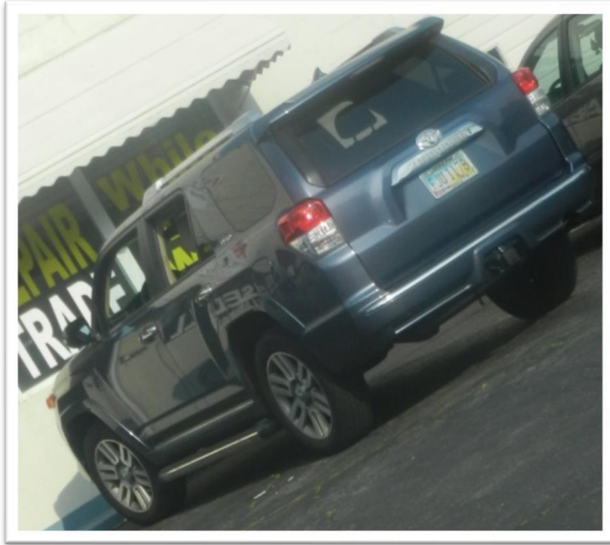
Figure 4. An expensive vehicle

Sharai took a photo of an expensive vehicle (Figure 4), to explain how she too realized that life is not at all what she had imagined. The photo indicates the type of car she envisioned driving which is the opposite of the battered car she currently drives. Sharai used to admire the beautiful houses and cars she saw on television shows and magazines. Those beautiful images intensified the dream to improve her life. “It seemed like everyone had money. The African Americans we saw on television were very rich. To be honest, I was really shocked because the America I had in my mind was the movie life,” said Sharai. She and other participants came to the realization that the beautiful life portrayed on television was unreachable to immigrants and even to ordinary African Americans. Farirai, a mother of two who is studying for a certificate in licensed practitioner nursing followed her husband two years after he migrated to the United States. She