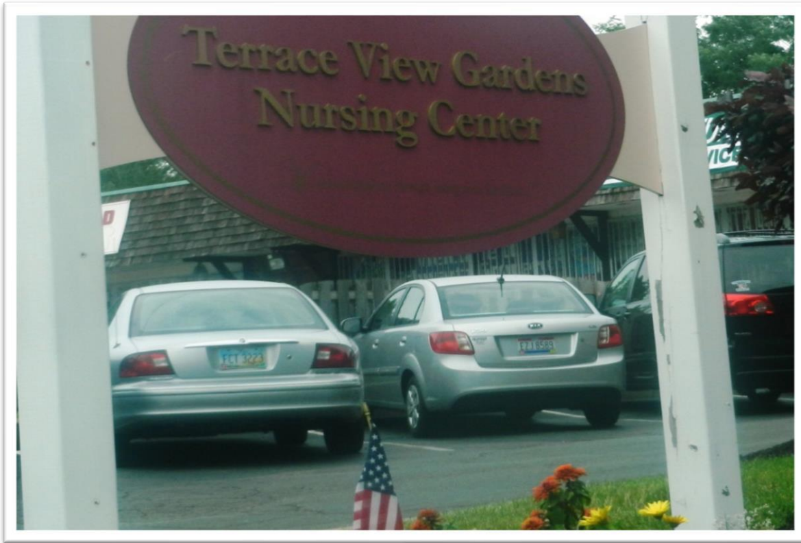
Figure 1. Home care facility

to explain that finding a job in nursing home care facilities is not difficult at all, “As long as you have the GED and able to do the job, they take you because it’s general labor. They don’t care in the health as long as you qualify.” Participants indicated that whilst the Licensed Practitioner Nurse (LPN) certificate cannot land them to better paying positions in hospitals, nursing homes employ them more. However, an education upgrade to become Registered Nurses coupled with time and experience increases their chances to acquire more rewarding positions in well-established health facilities. It took several years for one of the participants to accomplish her dream of becoming a Registered Nurse (RN). Now that she holds a Registered Nursing Diploma, she is looking forward to furthering her career in nursing; from working in a nursing home to pursuing a position in a hospital.