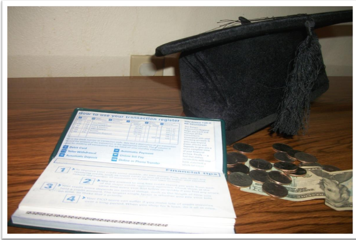
Figure 2. A college graduation cap

She explained that the graduation cap is a representation of her endless educational possibilities. Other women in the study also supported that they had always wanted college education but the cultural society coupled with the economic situation in Zimbabwe had limited their educational dreams. Some women stated that their parents could only afford paying school fees for girls up to Ordinary Level thereby limiting their opportunities to proceed to Advanced Level, which prepares students for University enrollment. Therefore, the women were happy with the opportunity to migrate to a country where they could find jobs to fund their studies.