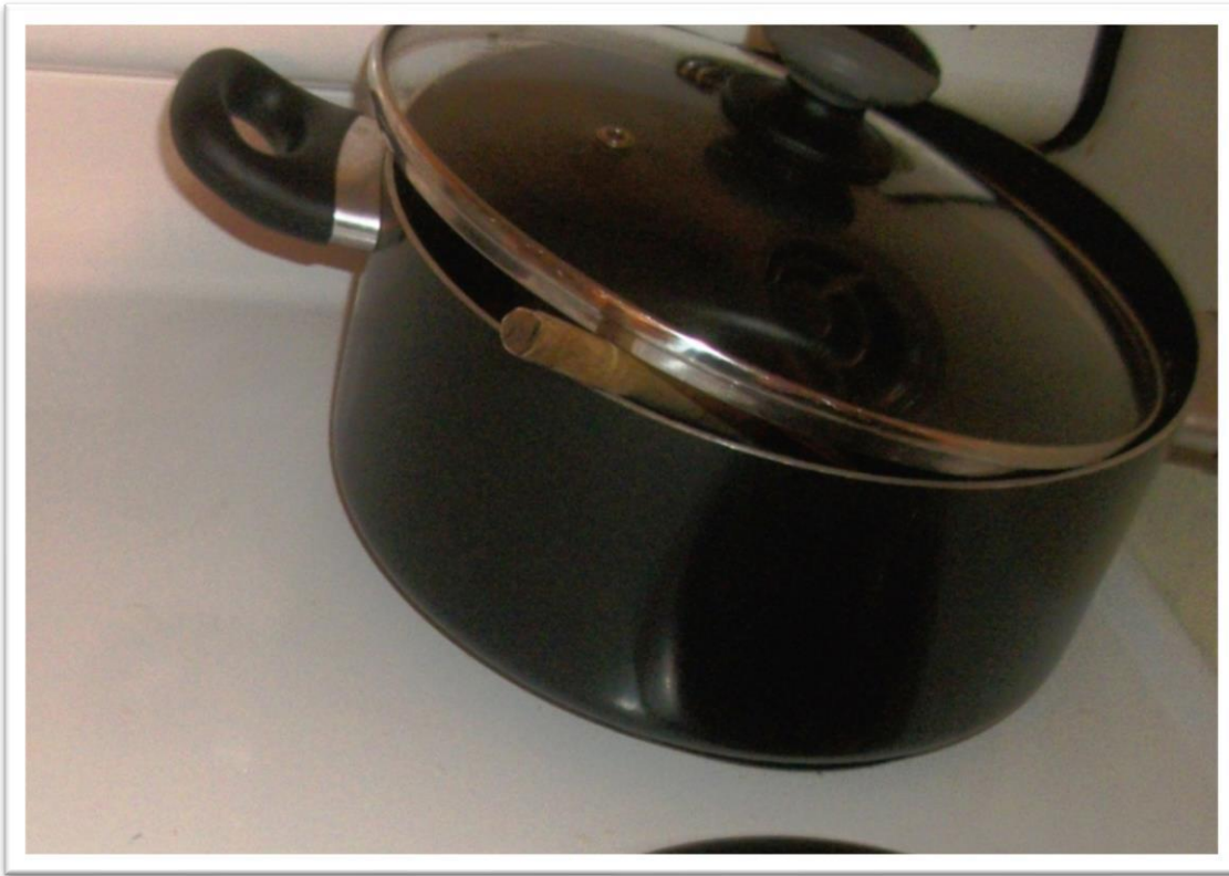
Figure 3. A saucepan on the stove

preparation as indicated by a photo of a cooking pot she took (Figure 3).