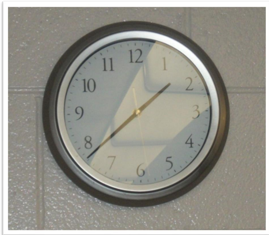
Figure 7. A clock